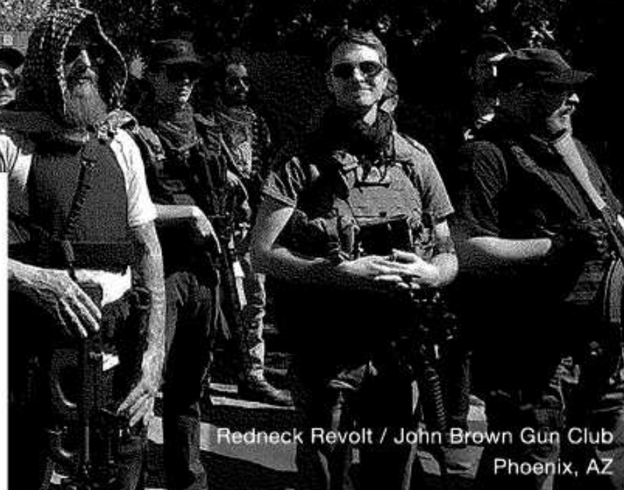
Redneck Revolt / John Brown Gun Club Phoenix, AZ